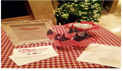
The Chandler Republican Women Christmas party was a huge success and resulted in a record number of new signs ups and renewals for the night. A table was set up at the door offering party attendees sign up forms and information as they entered the party.