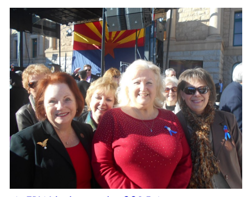
AzFRW ladies at the 2015 Arizona inauguration.