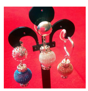
Matching Angel Earrings are now available for 2015!

participation, Arizona Republican Women are GEMS!