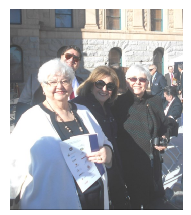
Ladies of Paradise Valley RW get photo bombed.