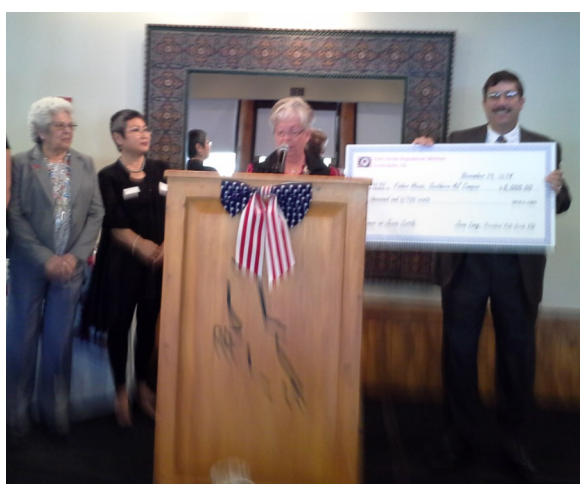
Palo Verde RW presents $5,000 to Fisher House in order to help build their Southern AZ campus outside of Tucson.