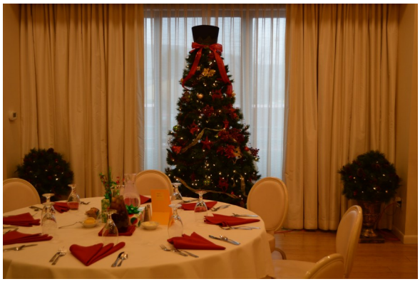
Verde Valley RW: Our Christmas party decorations.