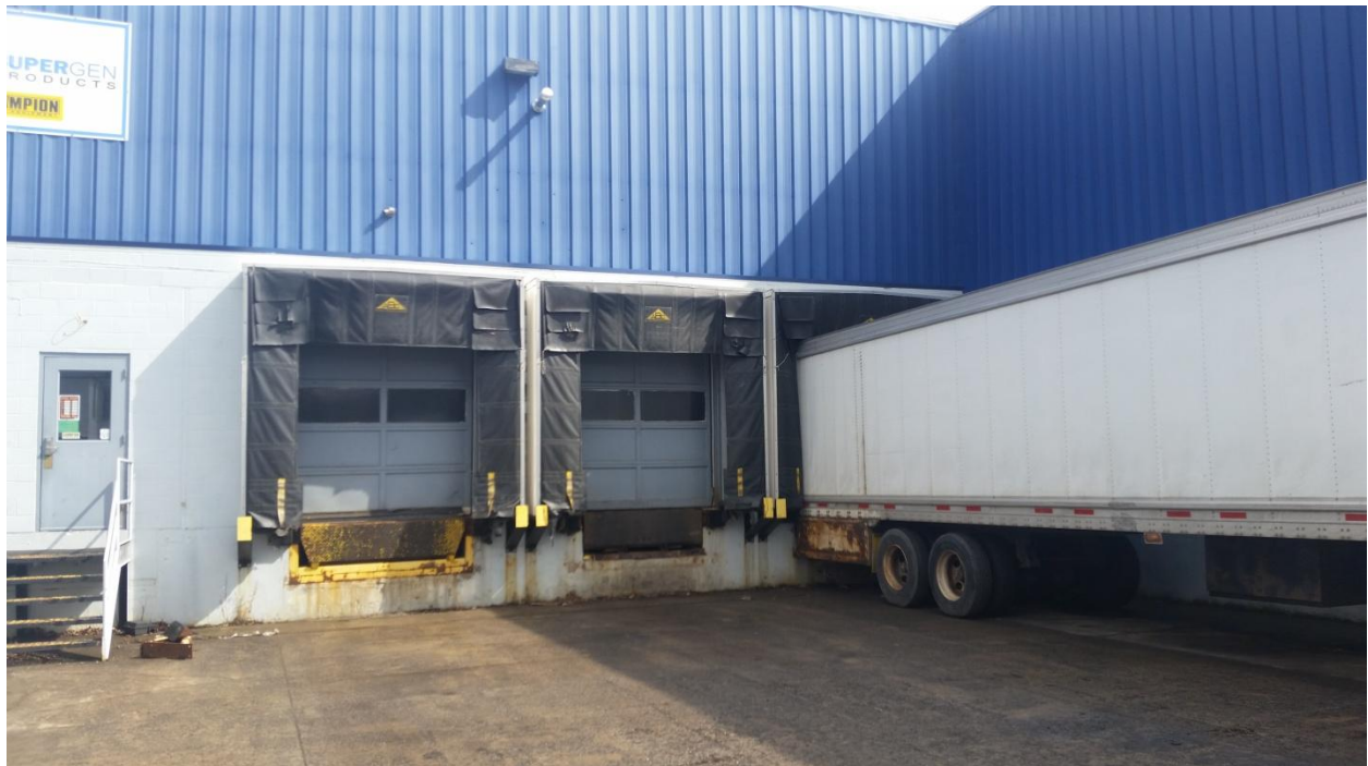
3 Loading docks