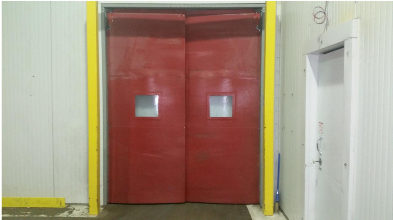
Cooler door large enough for fork lift