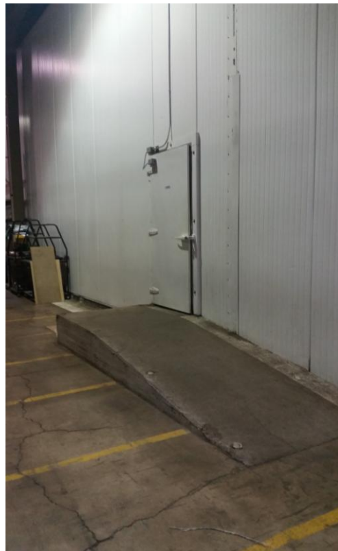
Freezer man door