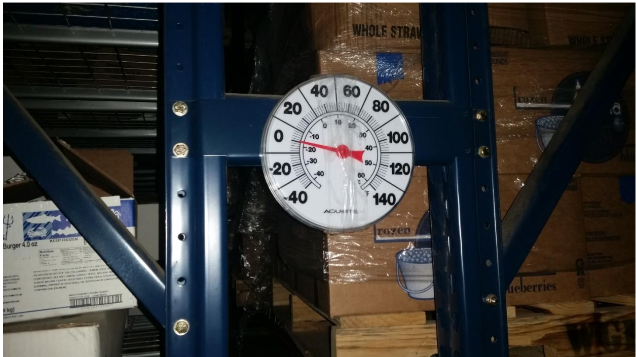
Freezer temp 0 Degrees