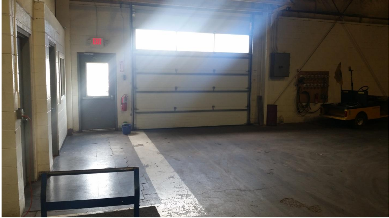
Ground level overhead door