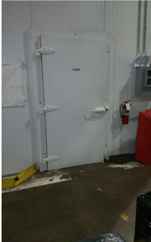
Cooler man door