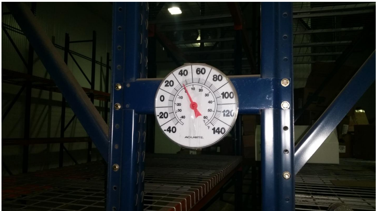
Cooler temp 34 degrees