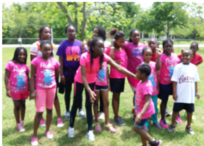
Family Fun Day

Congratulations to our graduating Students