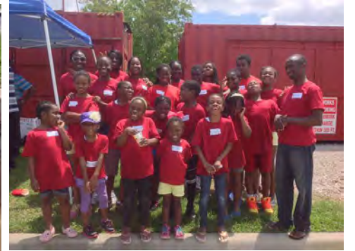
Fun at car wash