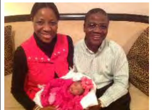
Naming ceremony of baby Oluwadimimu