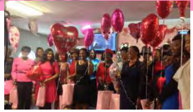
Celebration of love