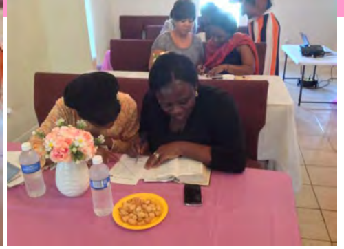
Women of impact quarterly fellowship