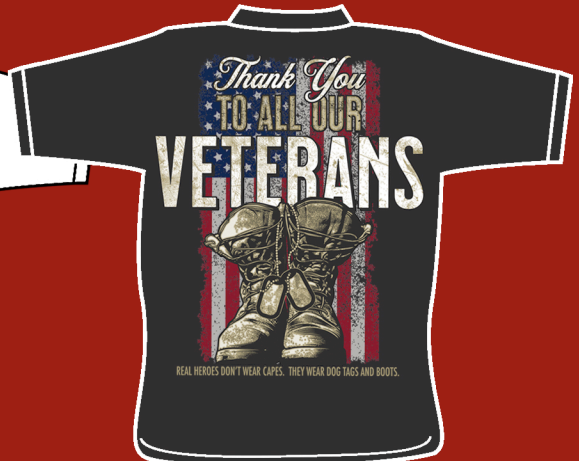
BR1040 THANK YOU VETERANS