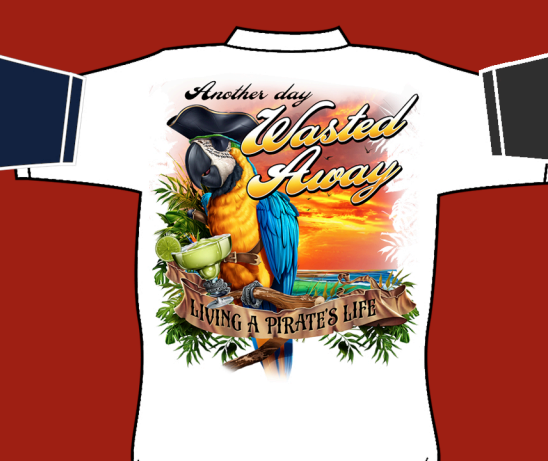
BR1036 WASTED AWAY