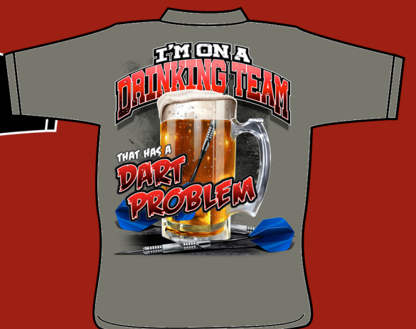
BR1021 DART PROBLEM Available on charcoal grey only.

Designs and styles are subject to change without notice. Please consult our website at www.BarRags.com for the most current collection of designs.