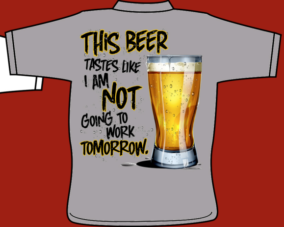
BR1033 NO WORK TOMORROW