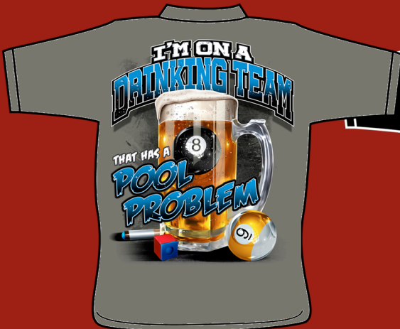
BR1015 POOL PROBLEM Available on charcoal grey only.