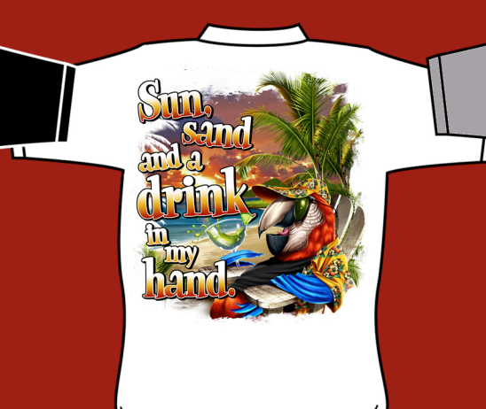
BR1028 DRINK IN MY HAND