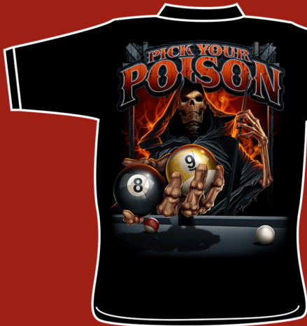
BR1002 PICK YOUR POISON Available on black only.