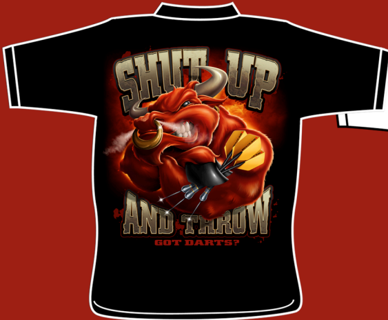
BR1010 SHUT UP & THROW Available on black only.