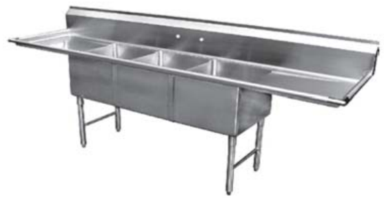
Three Compartment Sink