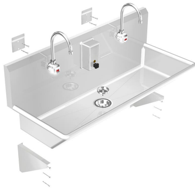
ADA Wash Sink