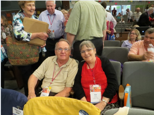
Pictures of Inland West Delegates between Legislative sessions in the Auditorium.