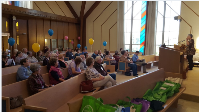
During our opening worship we celebrated our gratefulness with balloons.