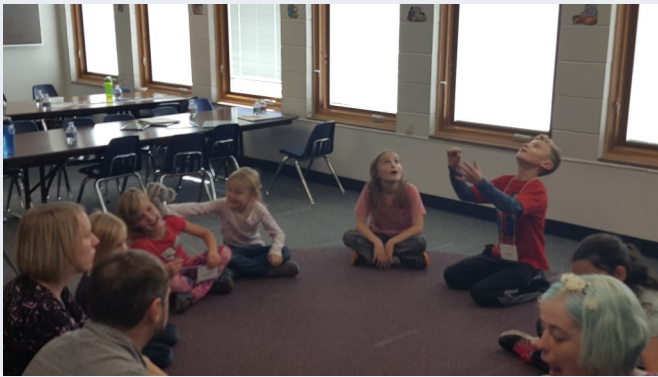
The kids having fun during one of the breakout sessions.