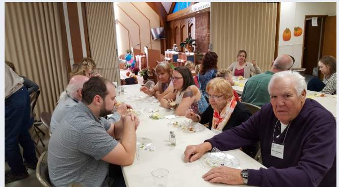
Saturday night's catered dinner was delicious and the fellowship great.