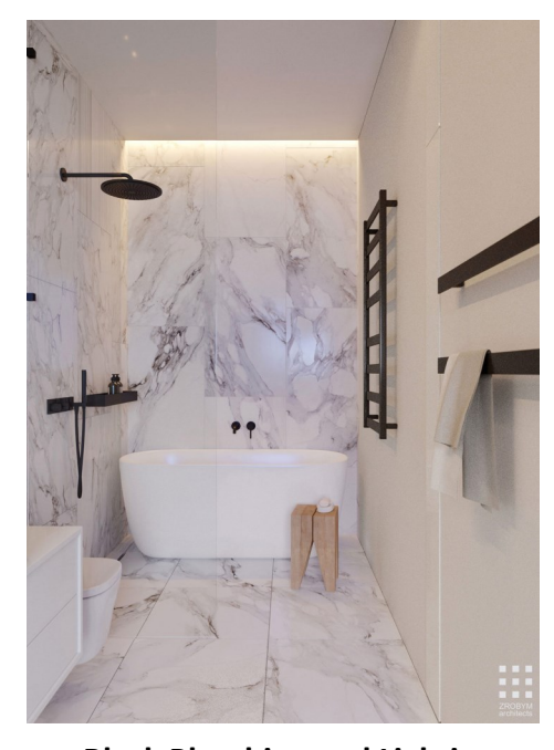
Black Plumbing and Lighting Fixtures are in: Surprising to no one this will grow and remain very popular for 2020

Refreshing Simply: On the technology side, homes keep getting more and more complex but industry design experts see minimalism coming strong. Now its about keeping things simply and making families feel homey and warm. The world of technology is overwhelming and experts agree that we all want our lives decluttered and simple.