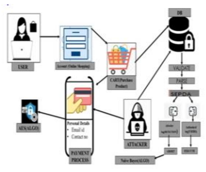
Fig 1: System architecture