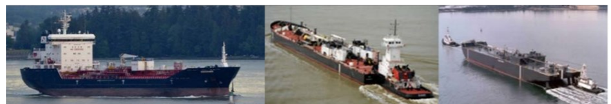
Vessels identified in ESHB 1578. From left, a 17,000 DWT oil tanker, a Crowley ATB, and a towed oil barge

As of September 1, 2020, tug escorts will be required on tank vessels between 5,000 and 40,000 deadweight tons in Rosario Strait and connected waterways east. The Board will be hosting a webinar to explain the Interpretive Statement, provide information regarding next steps for ESHB 1578, concluding with a Q&A session. If you are interested in attending one of the two webinar sessions being offered, please register here .