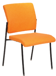
FI-4 A : 20" C : 18" E : 16"