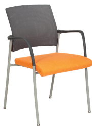
FH-4 A : 20" C : 18" E : 15"