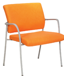
FB-4 A : 25" C : 18" E : 16"