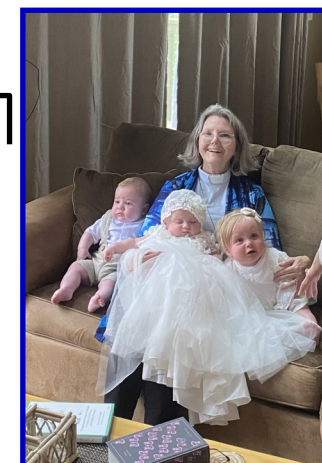
Baptism of 3 cousins!