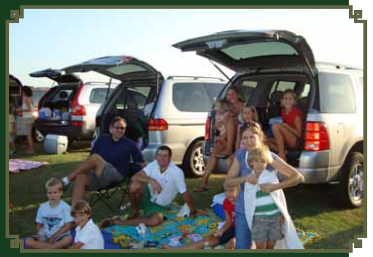
Tailgaters enjoy Saturday evening Polo at Prestonwood