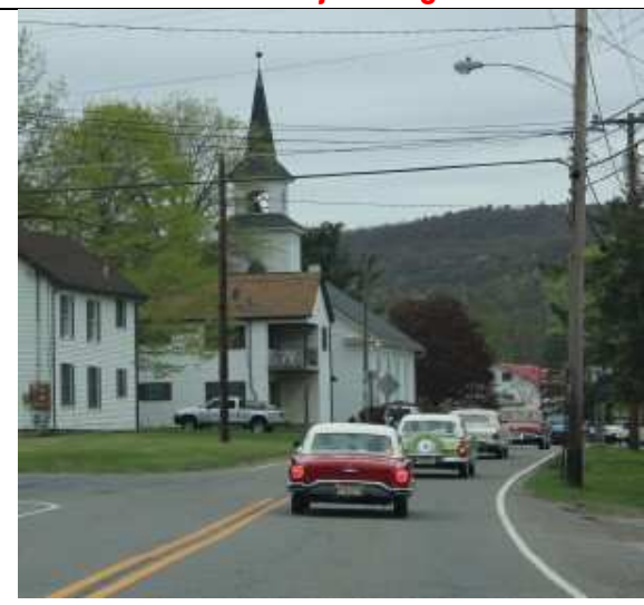
D Day, June 6, 1944 73rd Anniversary

http://holtononline.com/carshows.html http://www.newjerseycarshows.com/ www.njortc.org