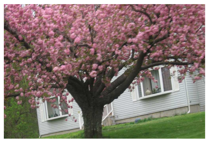
Summer Soltice June 20th Longest day of the year Beginning of Summer Days start getting shorter