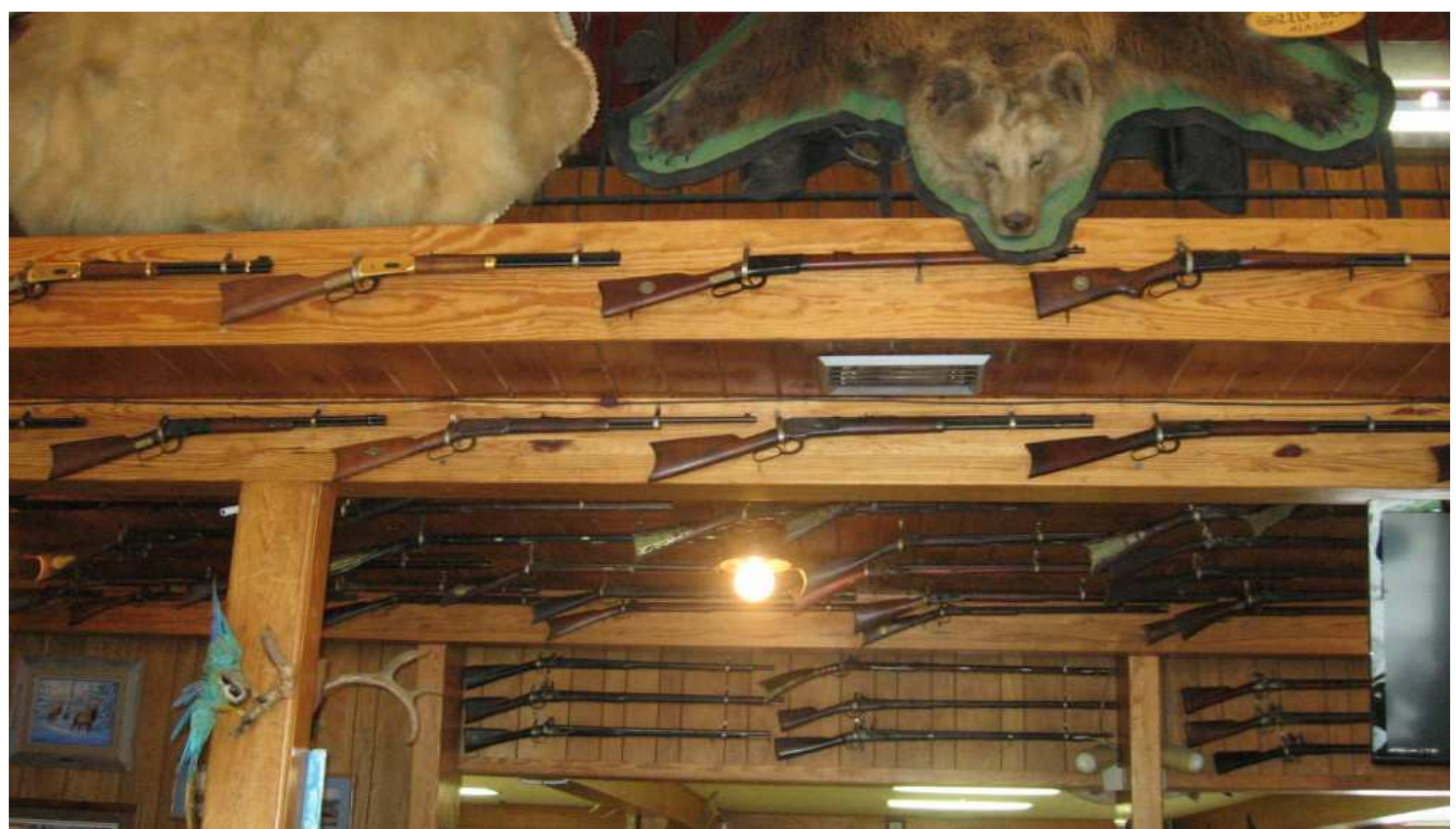
A very small section of the rifle collection