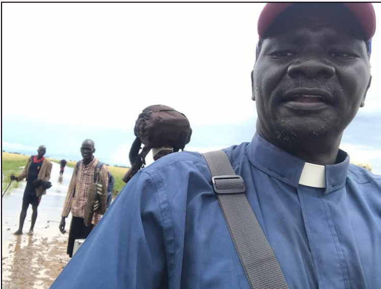
Photo Credit: Pastor Wal Reat; Caption: These pictures are taken on or way back from Jokow war-eda after our meeting in the beginning of October.

Photo Credit: Pastor Wal Reat; Caption: These pictures were taken during our baptism schedule at Kule two refugees camp, friends and relatives enjoy viewing the pictures.