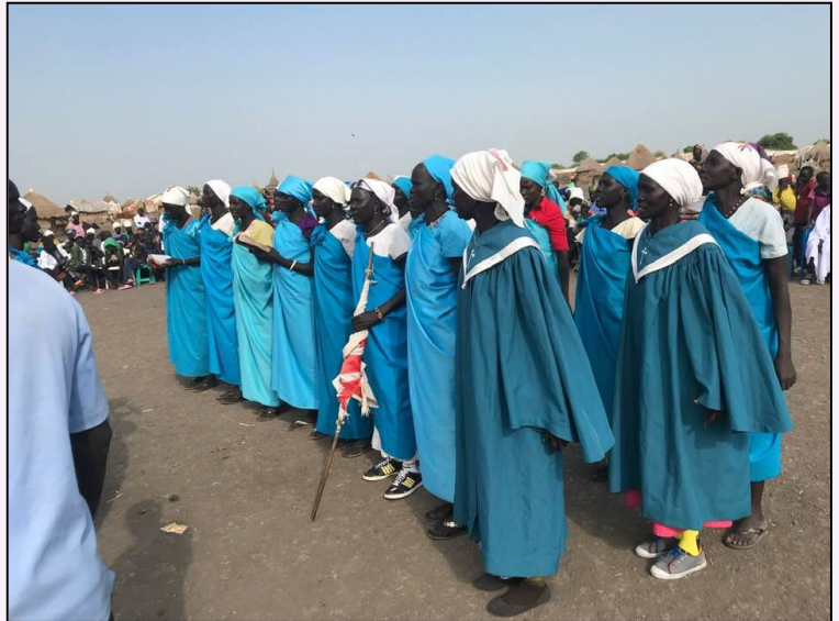
Caption: This South Evangelical Lutheran Church Africa Mission-Gambella outreach. We celebrate New Year in Burebiey cross river to South Sudan.

These photos were shared via Wal Reat's Facebook page. The captions included below each photo come directly from the captions provided with the photo posted.