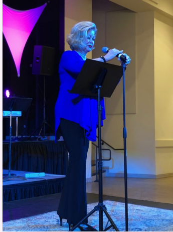
Mama's House Representative