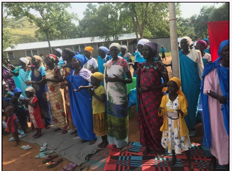
Photo Credit: Pastor Wal Reat; Caption: These pictures were taken during our baptism schedule at Kule two refugees camp, friends and relatives enjoy viewing the pictures.

Photo Credit: Pastor Wal Reat; Caption: These pictures are taken on or way back from Jokow war-eda after our meeting in the beginning of October.