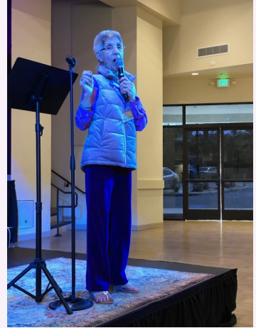
Shelter from the Storm Representative