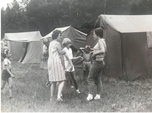
TENT CAMPERS AT SUNSET VILLA IN THE 1960'S