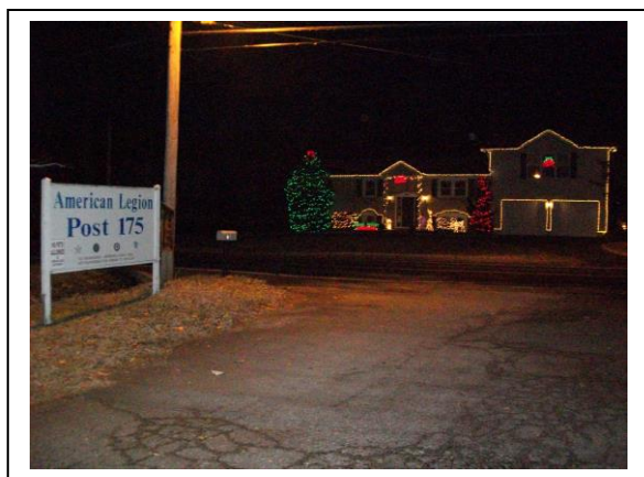
The holiday spirit of our neighbor every year