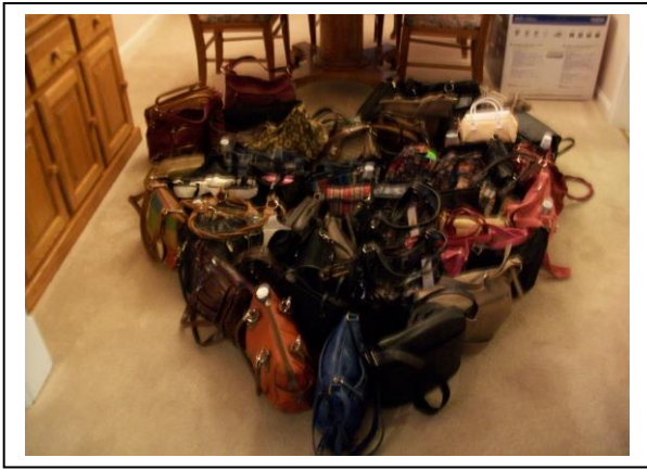
The 55 Pack-A-Purses from our drive.