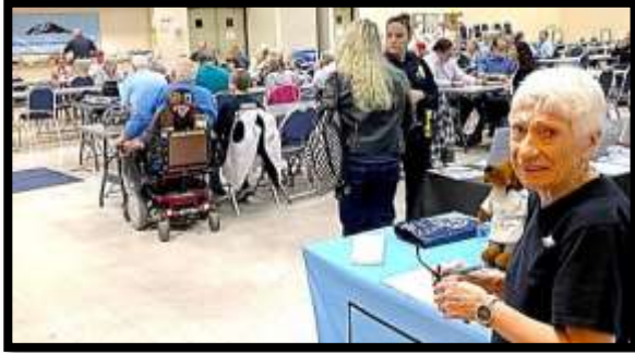
Goldie welcomes all!