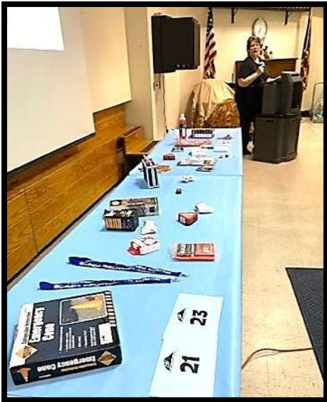
Crime Prevention & Safety Items for distribution