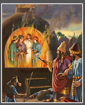
People of YHVH Must Refuse