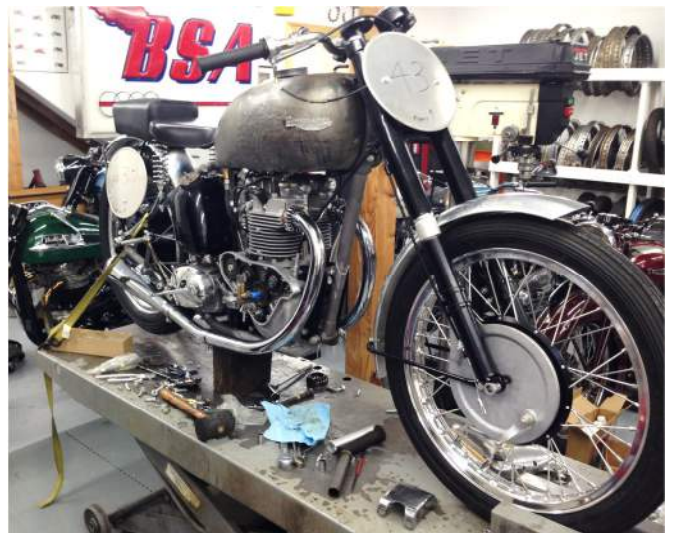
Tom Ruttan's 1949 Triumph Grand Prix Factory Racer