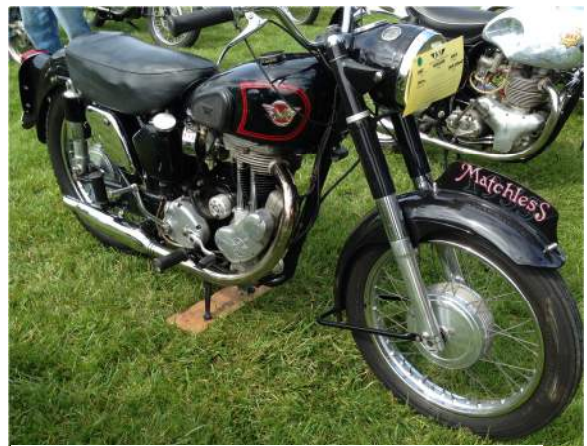
Arne Ostraat's 1955 Matchless G80S, 500 cc