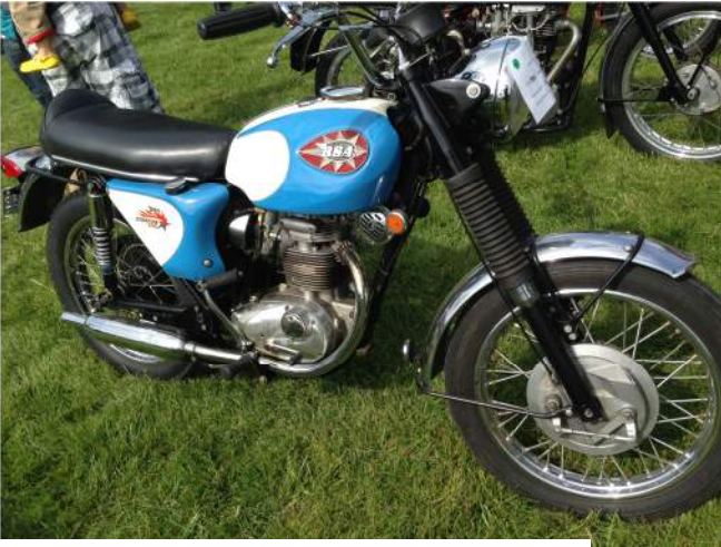
1969 BSA Starfire, 250 cc