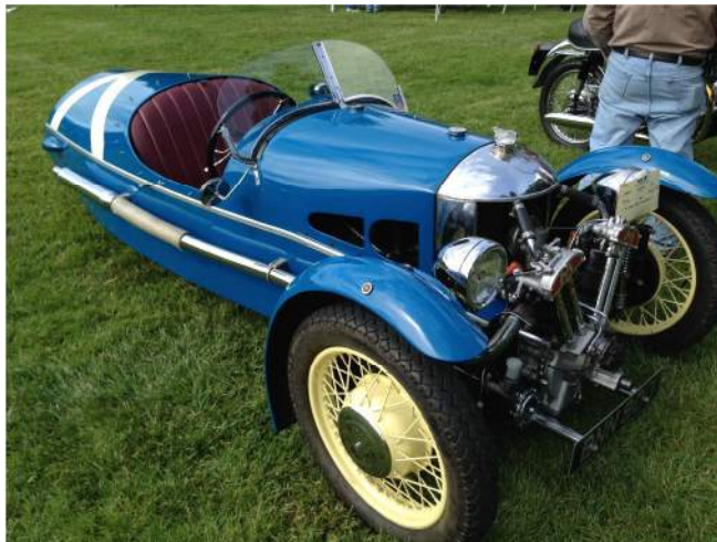
1935 Morgan Super Sport, Water Cooled 990 cc Matchless Motor, 3 speed with reverse, chain drive. Two seater.