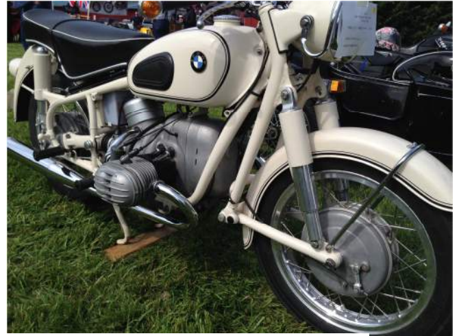
1965 BMW R60/2, 600 cc