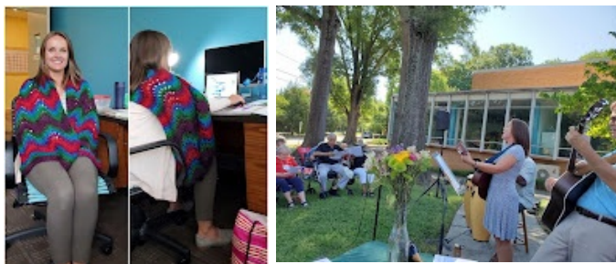
First day of internship wearing a beautiful prayer shawl made by members of HTELC