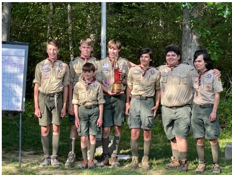
THE WINNERS: COUGAR PATROL!

Part I tests skills like 8-Knot, Scout's Pace, Nature Identification, Judging, Compass, and Water Boiling. First, we did Scout's Pace. The goal of this competition is to run/walk a mile in exactly 12 minutes using the 50-steps-walking-50-steps-running method. The patrol that runs/walks the mile closest to 12 minutes wins. Overall, most of the patrols came in early, with Panther patrol getting first place. The next competition involved using a compass. Most patrols didn't struggle at all with this and Flying Eagle came in first. After this was Nature Identification. Each patrol went around to marked plants and had to determine what species they were. Some patrols did much better than others at this, with Cougar winning first place. Judging is a competition about estimating certain dimensions of objects. In this competition, Rattlesnake came first. Next, the Cougar patrol came first in the 8-Knot contest and got the troop record with a time of 55.92 seconds. The last challenge of the night was Water Boiling. As soon as our SPL said go, each patrol ran into the woods to get twigs and sticks to use to build their fire. All patrols managed to make a fire with Moose patrol getting first place. At the end of the night, the Cougar patrol was tied with the Panther patrol for first place, with Flying Eagle in second and Moose right behind in third.