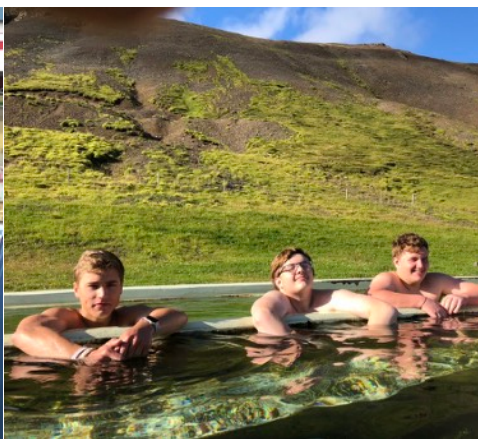
THERMAL POOL IN ICELAND