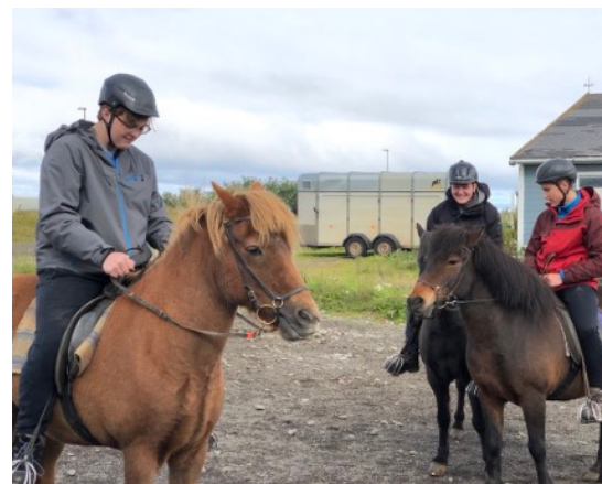
FIRST TIME ON A HORSE!