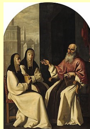
St. Jerome with St. Paula and St. Evstochium

Oct. 31—Transformation: The Evangelical Counsels for Lay People