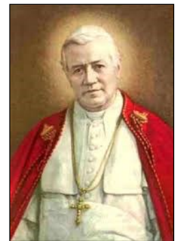
Feast Day: Sept. 21

Sources: franciscanmedia.org and stpiousparish.net