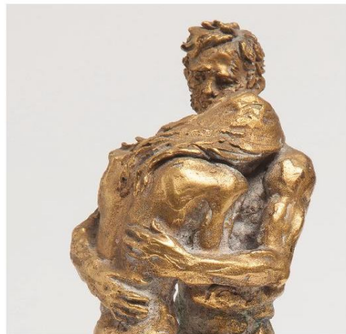
Piece: Prodigal Son , 1956 Artist: Francesco Messina Location: Vatican Museums

Do I live gospel charity and love with all its consequences?