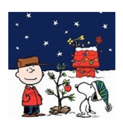
From Christmas 2017