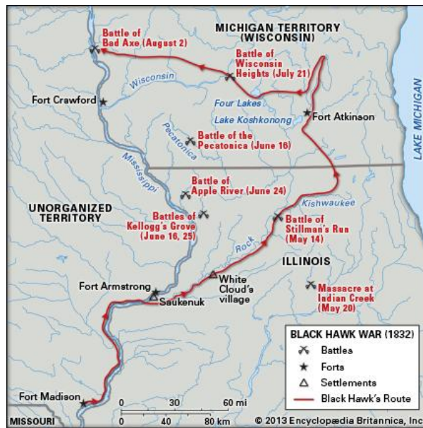
Map Of Key Battles In The Blackhawk War