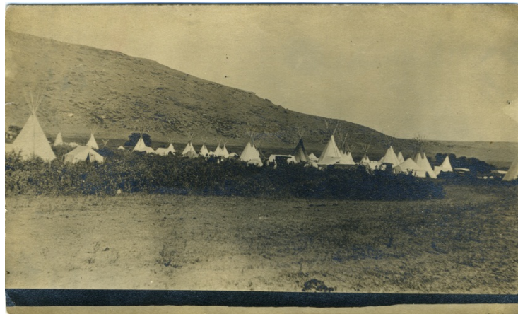
Indian Villages Dot the Eastern Landscape Before Removal Begins

By the time Jackson enters office, the wheels have already been set in motion to allow white settlers to usurp the lands of the southeastern Indian tribes.