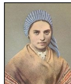
Feast Day: April 16

Bernadette Soubirous was born in 1844, the first child of an extremely poor miller in the town of Lourdes in southern France. The family was living in the basement of a dilapidated building when on February 11, 1858, the Blessed Virgin Mary appeared to Bernadette in a cave. Bernadette, 14 years old, was known as a virtuous girl though a dull student who had not even made her first Holy Communion. In poor health, she had suffered from asthma from an early age.