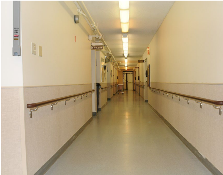
Fresh paint, new railings, wall decor

The residents, visitors, and team at Greenwoods Long Term Care (LTC) are enjoying the results of an ambitious hallway refurbishment project, initiated in April 2021 and completed in October 2022. The $140,000 cost of the work was funded by the community through generous donations to the Greenwoods Foundation.