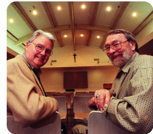
A candidate and his sponsor sit for a photo after an Order of Christian Initiation for Adults (OCIA) class.

I am happy you have responded to the stirrings of the Holy Spirit within you and answered the call to deepen your spiritual practice and journey. The Church needs you. The people of God welcome you. You are beloved among us, and your response in faith is a powerful witness, a reminder to those who may be tempted to take for granted the gift of faith. Thank you. ●