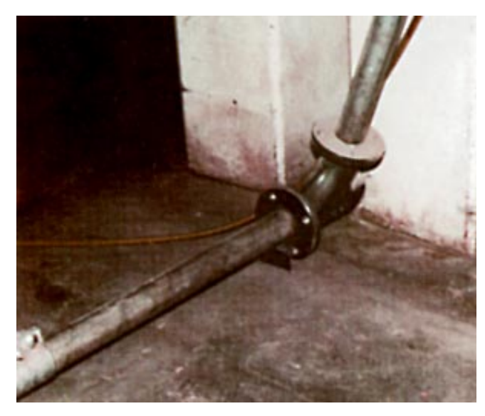
FIGURE #2 The HammerTek Smart Elbow<sup>TM</sup> sends "fines" from a line on the floor upwards to the cyclone. These fines are small food particles which are later recycled back into the production line. The upper end of this vertical run is shown in figure 3.