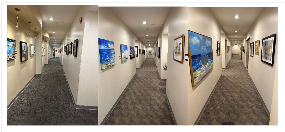
Art Exhibit at the Community Center