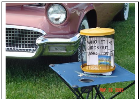
Alec's display at some recent car shows