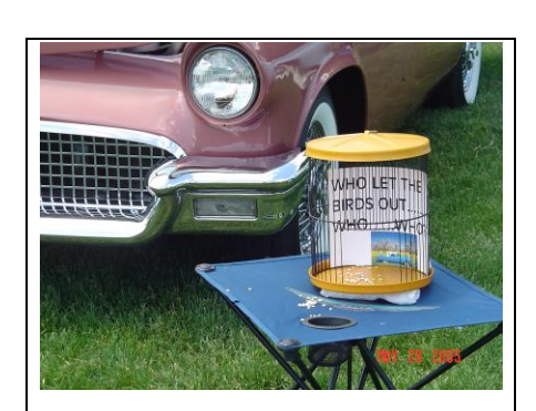
Alec's display at some recent car shows