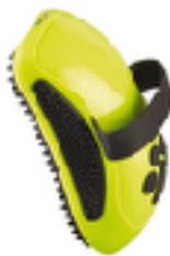
The curly comb.