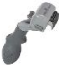
Adjustable Dematter Tool.

If your lagotto becomes matted you can always shave them down. We like to prevent mats. If we see a mat developing we use the demoting tool to break it up. Other useful tools that we have are: