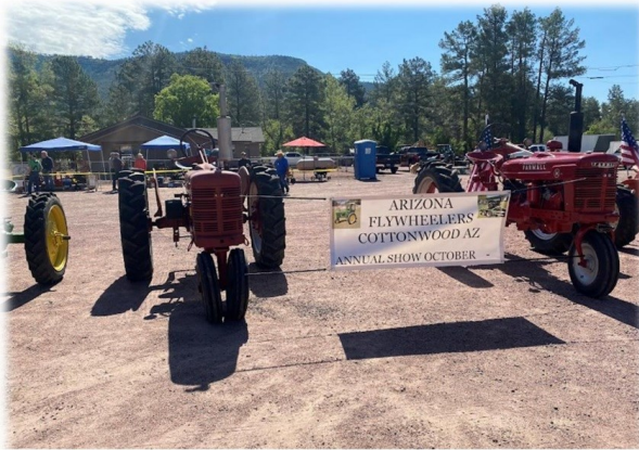
Club banner at the Pine Show