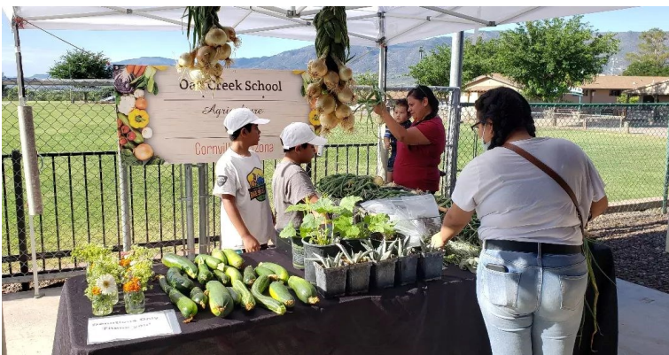
Cornville school (Oak Creek Elementary) students selling their produce at the local Farmer's Market