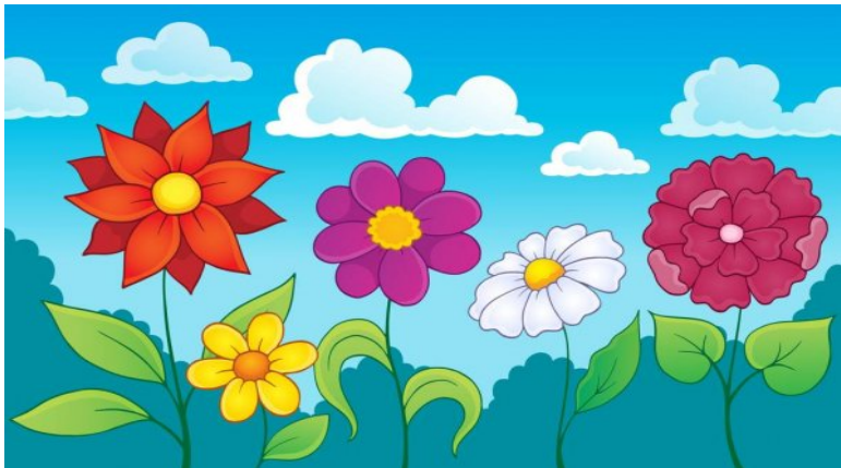
Berkeley Commons Homeowners Association The Berkeley Spotlight Spring Edition 2021

We hope you enjoy your new home and community!