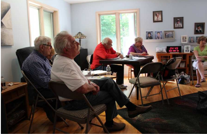
July 5 is National Bikini Day. Gender non-specific - get them out