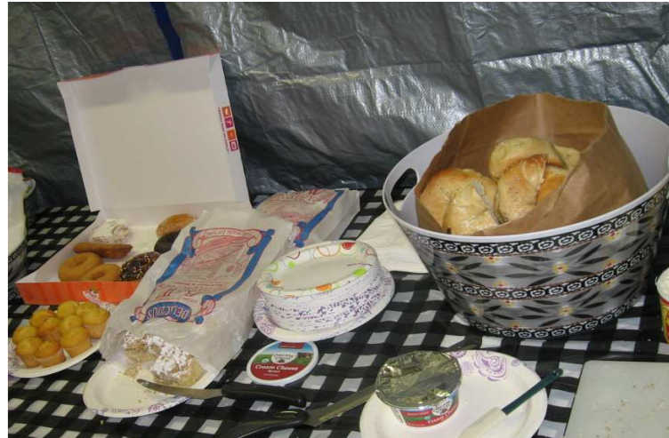
Treats for the early birds (the human kind)