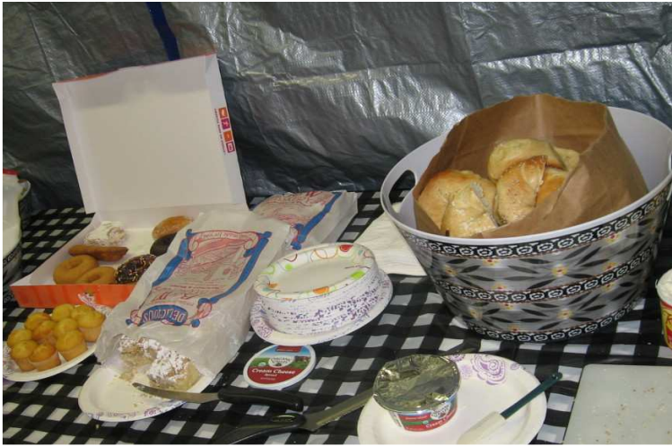
Treats for the early birds (the human kind)