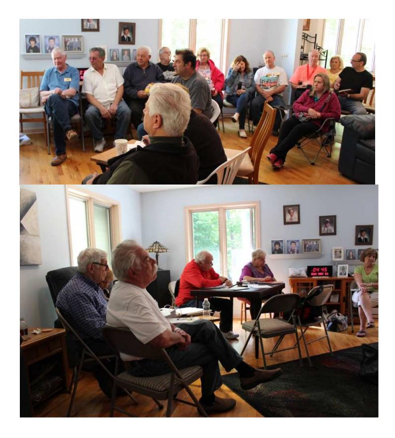
July 5 is National Bikini Day. Gender nonspecific - get them out