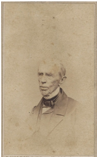
Francis P. Blair (1791-1876), Member of Jackson’s New Kitchen Cabinet

The venom he feels is directed particularly at John Calhoun.