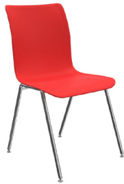
CO4A A : 17 3 / 4 " C : 18" E : 16 3 / 4 "