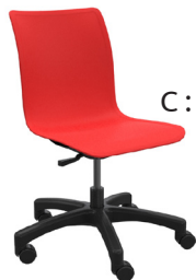
COBE A : 17 3 / 4 " C : 15 3 / 4 " - 21" E : 16 3 / 4 "