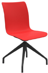
COBP A : 17 3 / 4 " C : 17 1 / 2 " E : 16 3 / 4 "