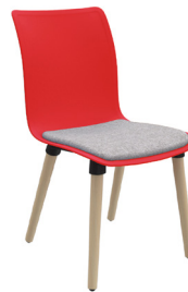
CO4B A : 17 3 / 4 " C : 18" E : 16 3 / 4 "