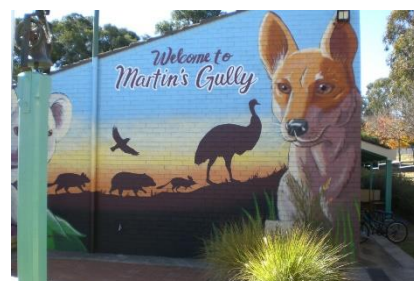
Martins Gully School