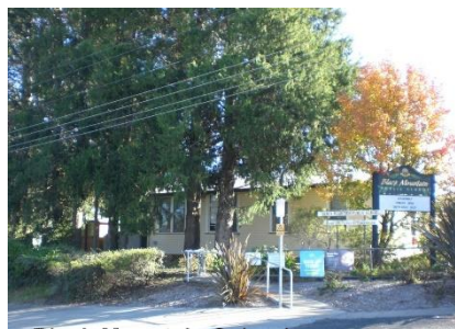
Black Mountain School