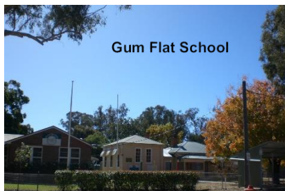
Gum Flat School