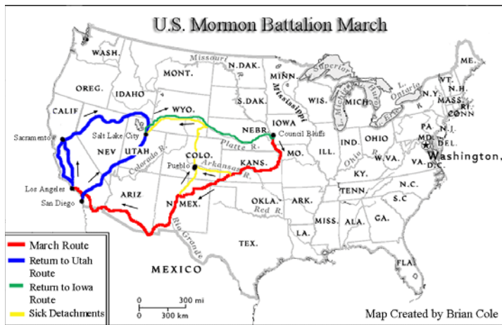
Map Of The “Mormon Brigade’s” Overland March – July 1846-47

During their stay in Illinois, the Mormons have consistently supported the Democratic Party, including both Stephen Douglas and James Polk.