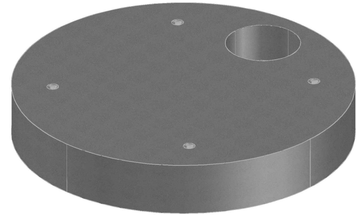
ISOMETRIC VIEW NTS