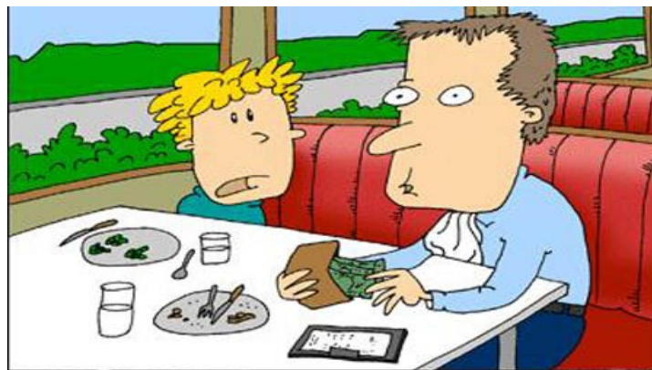
HOW COME THE WAITRESS GETS 15% AND GOD ONLY GETS 10%?

On the Funny Side! (who said church has to be boring? )