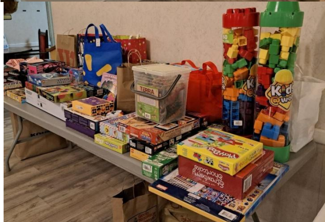
The toys were donated to the Haverstraw NY youth center