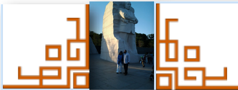
From A Few Came Many

Continue upon the path sharing love today that love finds itself into tomorrow. There are still generations which awaits to be born, who will charge the lack of what they did not find into the account of those who failed to mind that although tomorrow is never promised. 'Wow man!!!' You may one day hear them say. 'You could at least have opened the door, the rest I would've done myself. Daggone, daggone!!!'