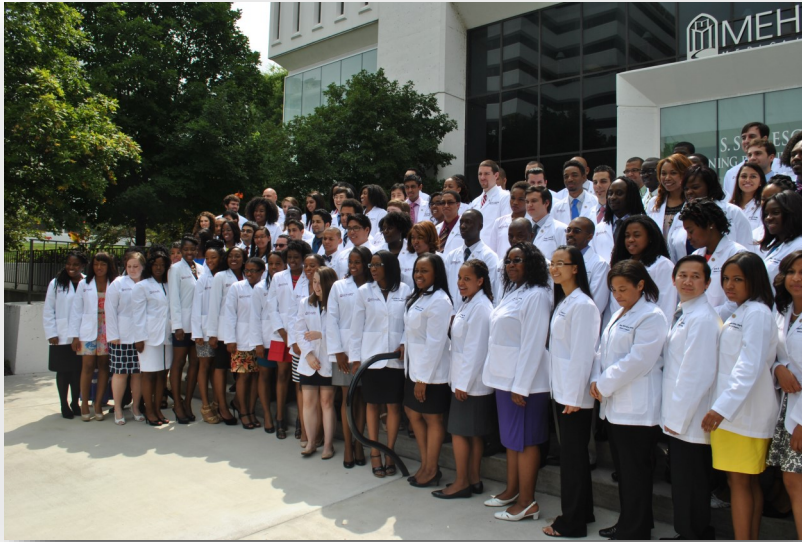
Meharry Medical College—Class of 2017