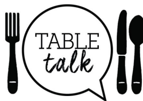
Table Talk Small Groups

We invite you to join us in a small group setting centered around food and faith journeys. From May to July, meeting at least once a month, we will connect with around 6 other people from Church. Couples and Singles are invited to join. Signup Sheets are available near the bulletins and at https://form.jotform.com/223085236465053 .