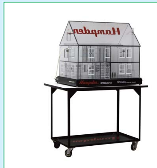
Model H-HEAT-2A Air Distribution System Trainer on Cart Option Shown with Option H-HEAT-2A-MT Mobile Table