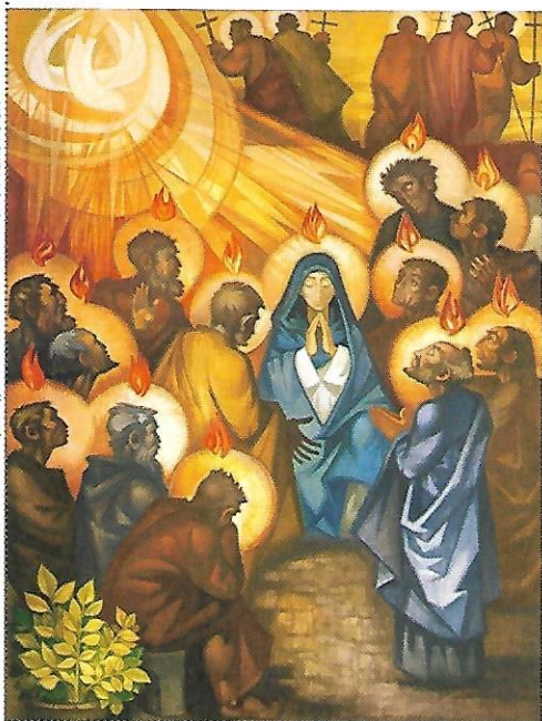
PENTECOST BY NAVARRO PEREZ DOLZ (1990).