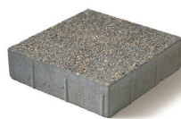
12" x 12" x 2 3/4" 30cm x 30cm x 7cm